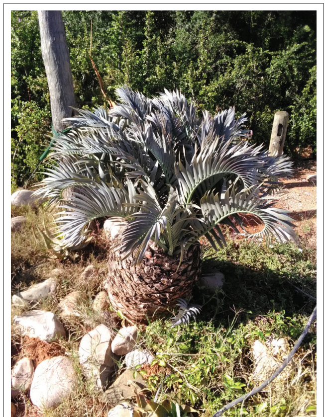
FIGURE 2: Healthy planted individual Encephalartos lehmannii cycad in Addo Elephant National Park garden.

After 3 years, we concluded that of the 18 cycad individuals planted in the gardens of AENP, nine are in good condition with leaves (50%) and six are dead (33%). Because cycads can remain dormant for a long time without bearing leaves, it is difficult to assess whether individuals are dead or alive when the stem is still in seemingly good condition. The condition of three of the above-mentioned cycads could not be determined accurately and was recorded as standing (17%).